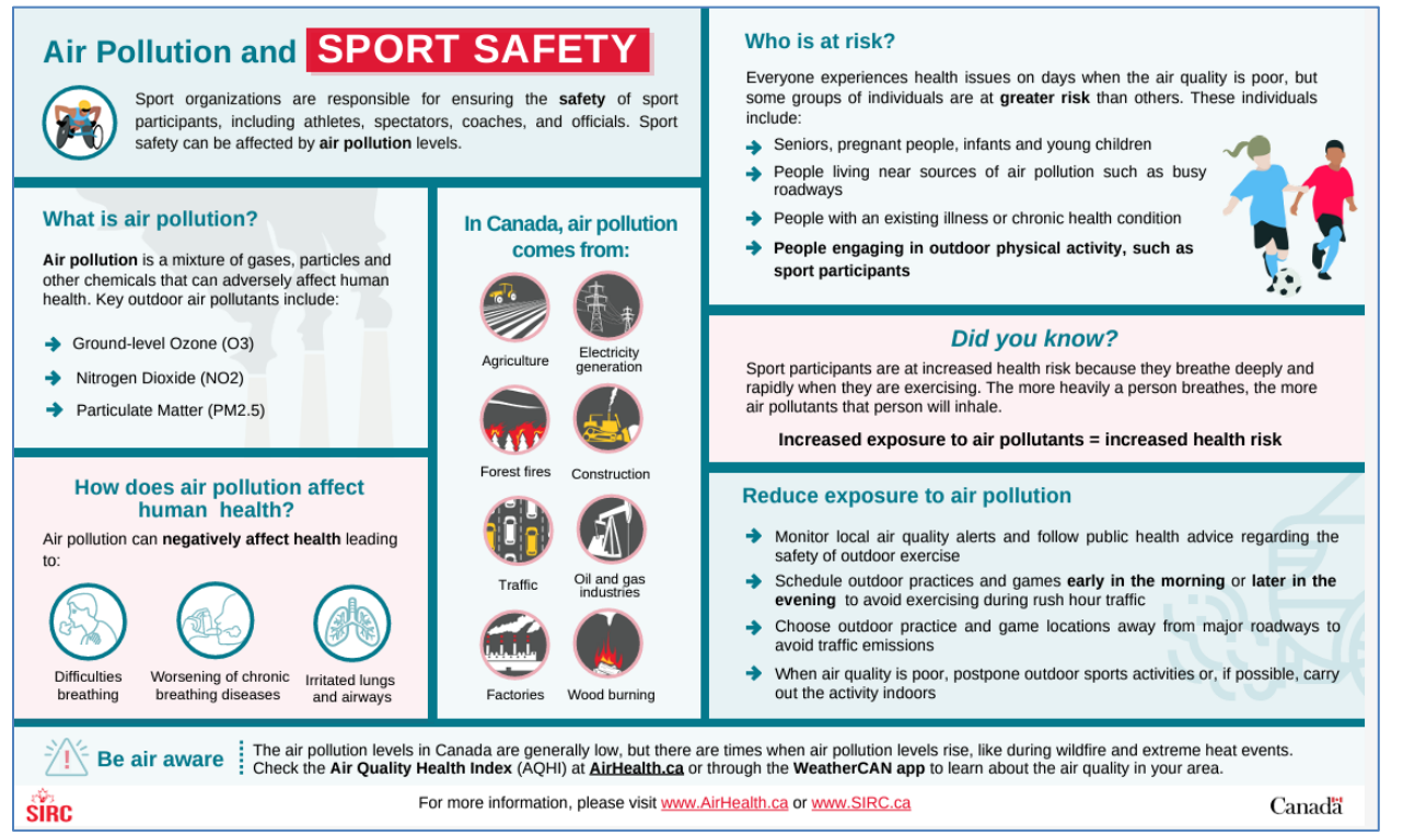
Figure 5.1.

Air quality must be considered when participating in outdoor activities such as paddling, and proper precautions must be used to ensure Participants are not exposed to high levels of Air Pollution.